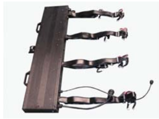
Individual power box