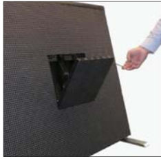
Front and rear serviceable